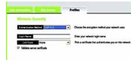
Figure 6-19: EAP-TLS Authentication

Click Next to continue or Back to return to the previous screen.